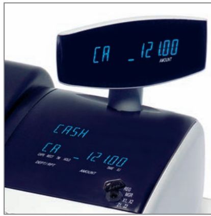
BRIGHT, EASY-TO-READ operator display and adjustable pop-up display