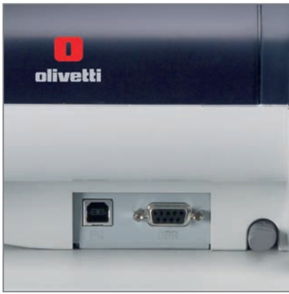
USB AND SERIAL PORTS for PC and scanner connectivity