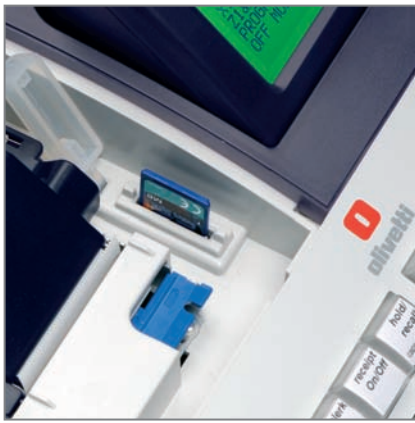
Slot for optional SD MEMORY CARD