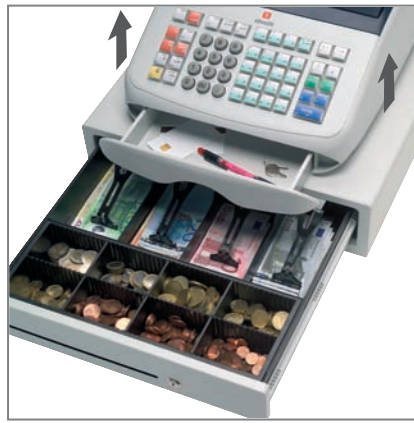
DETACHABLE ROBUST and practical drawer