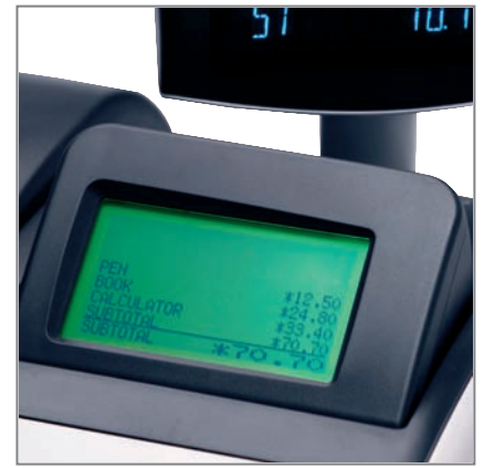
GRAPHICAL OPERATOR DISPLAY , for immediate viewing of transaction details and easy system programming